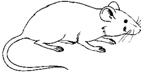
Fig. 2. The black-and-white line drawing depicting the stimulus word mouse .

of the images used in the experiment appears in Fig. 2). Half of the line drawings illustrated words with high C and the other half illustrated words with low C . In each condition, equal numbers of words contained the same initial phoneme.